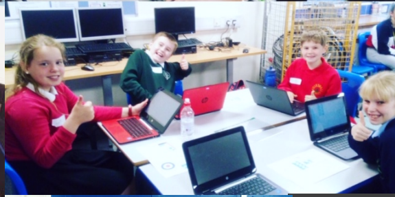
Our Eco Committee continues to battle hard with making our school a more environmentally friendly place! This month, they created an activity for the whole school to do during form time!