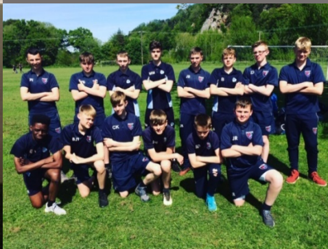
Our U15 Cricket team progresses to the next stage of the County Shield!