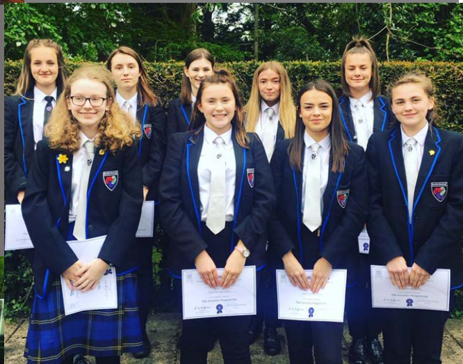
Our Brilliant Club (above) had their graduation at Oxford University this month! Each of them wrote essays of 2000 words, with many of them achieving a first at degree level! WOW!