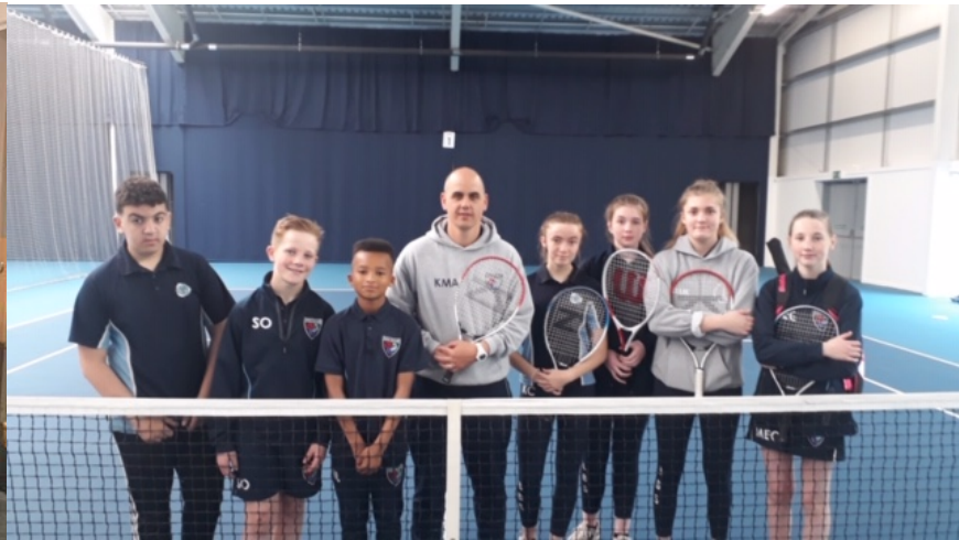
Our tennis ambassadors (above right) and three of our tennis players who competed in the Telford area qualifiers for the county finals (right).