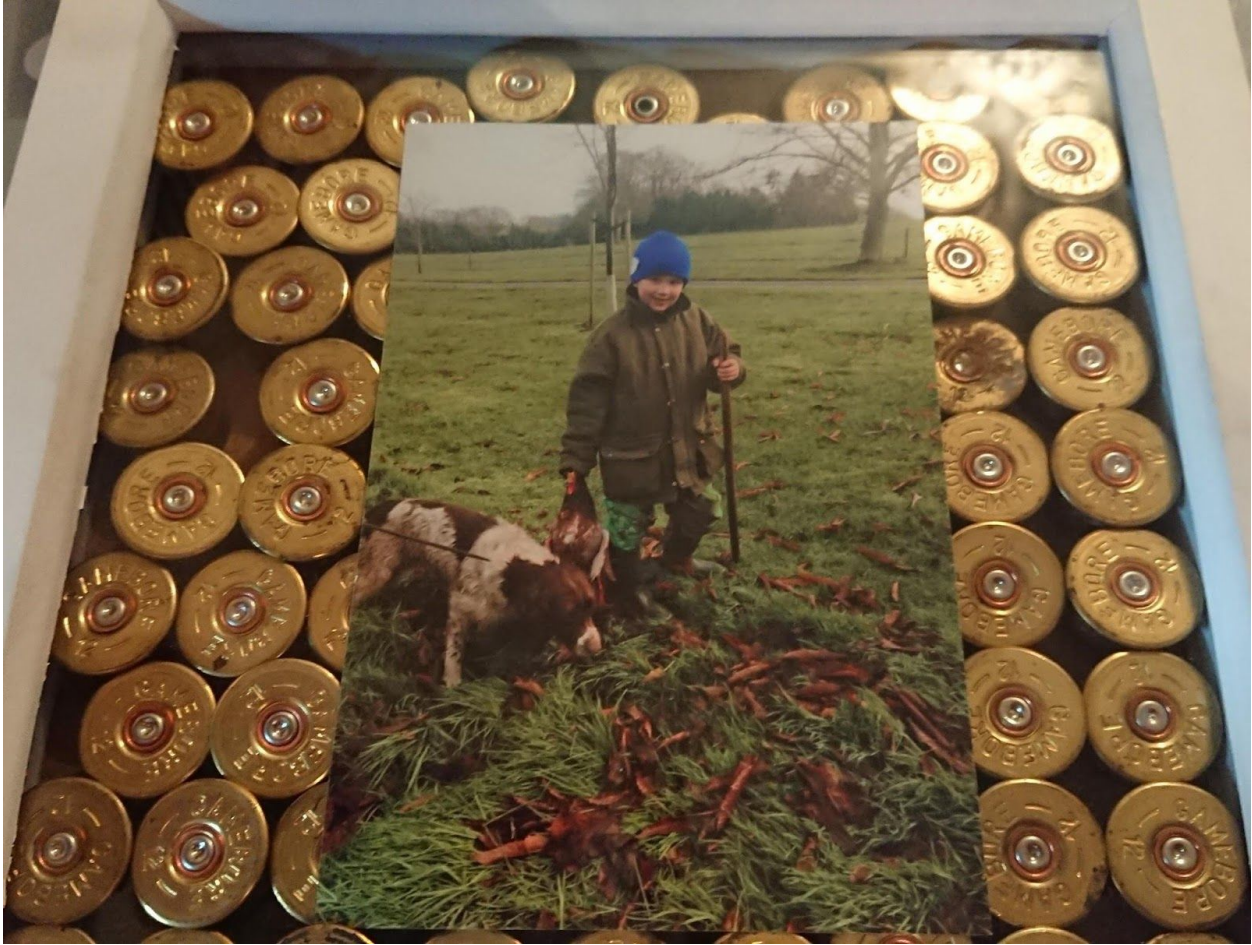
This is me on a shoot with my dad .