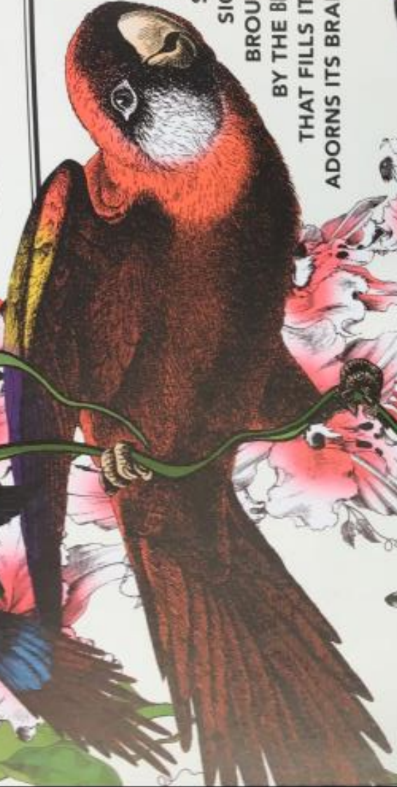
SCARLET MACAW Ara macao

SOME OF THE AMAZON'S MOST SPECTACULAR SIGHTS ARE BROUGHT TO US BY THE BEAUTIFUL BIRD LIFE THAT FILLS ITS SKIES AND ADORN'S ITS BRANCHES.