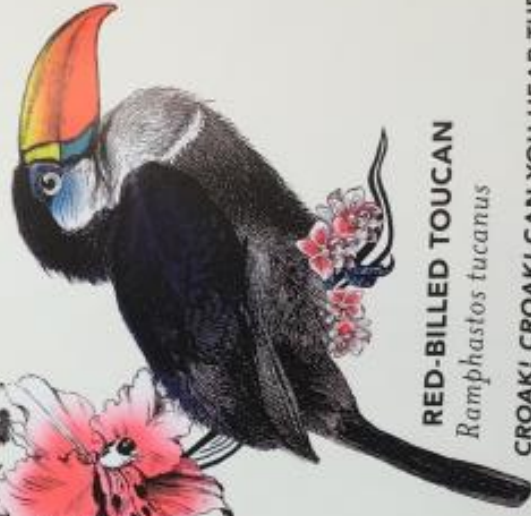
RED-BILLED TOUCAN Ramphastos tucanus

A FLASH OF RUBY AND GOLD FOLLOWED BY A PIERCING SHRIEK! announces the arrival of the scarlet macaw. Curious, social and noisy, the macaw belongs to one of the most intelligent animal families on the planet: the parrots. These chatterboxes love company. They often mate for life, and group together in large flocks of up to 100 birds. But macaws aren't all talk: they are able to use tools and solve problems, too.