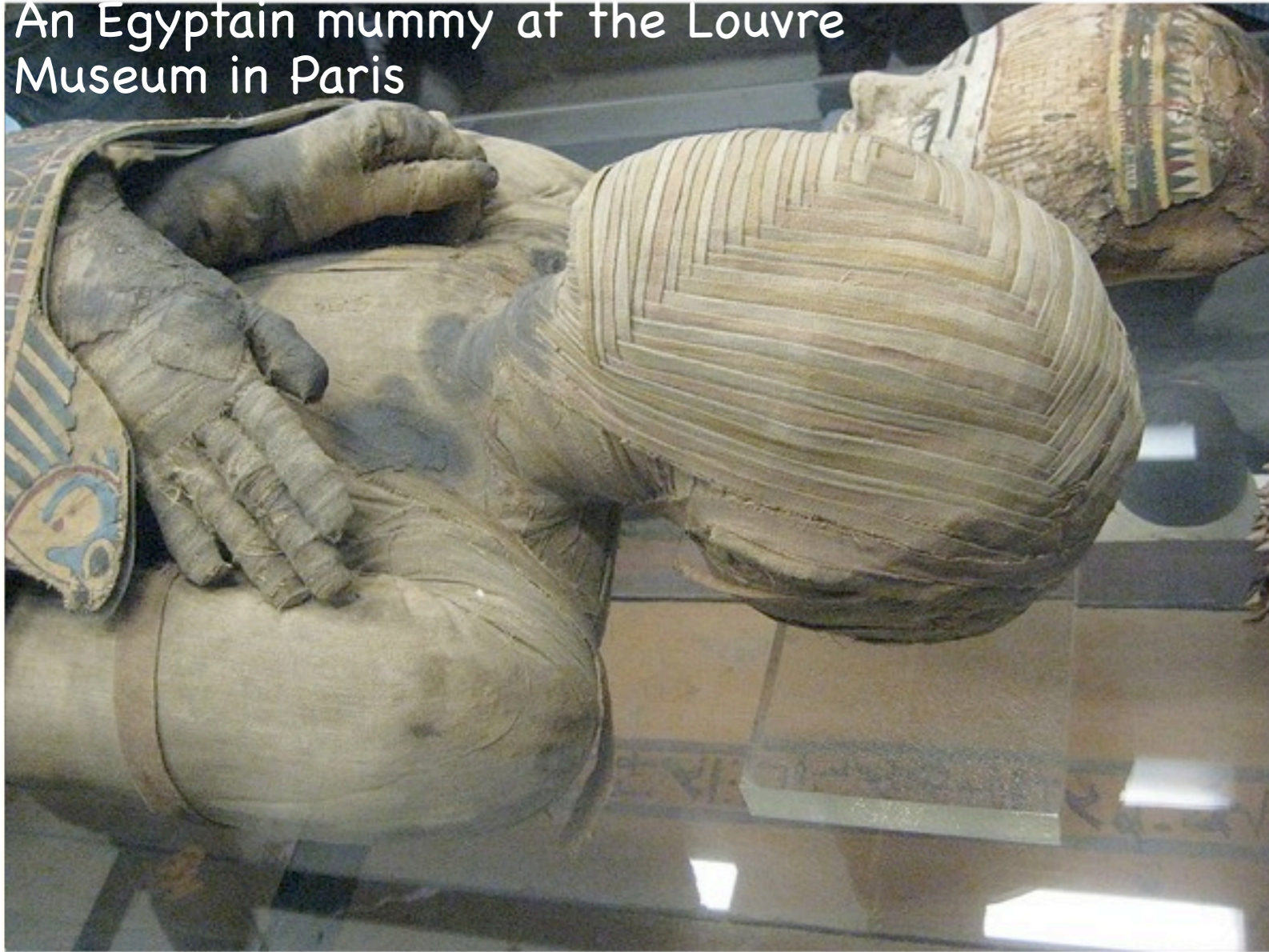
An Egyptian mummy at the Louvre Museum in Paris

when they died. Tombs were also filled with anything a person might need in the afterlife, such as clothes, food, furniture, jewellery and other treasures.