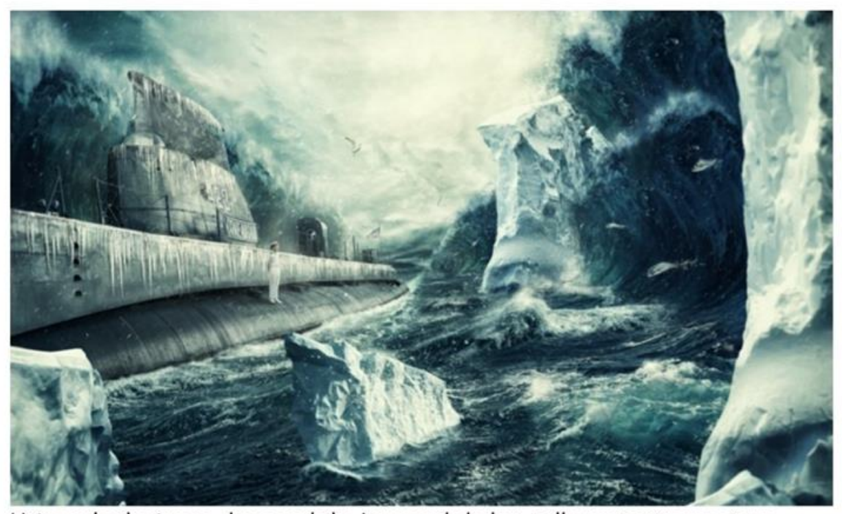
Using only the image above and the key words below, tell your partner a story.