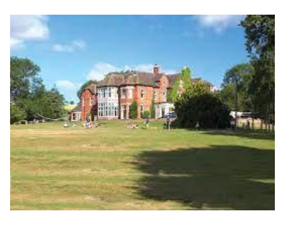
The adventure starts here! A warm welcome awaits!